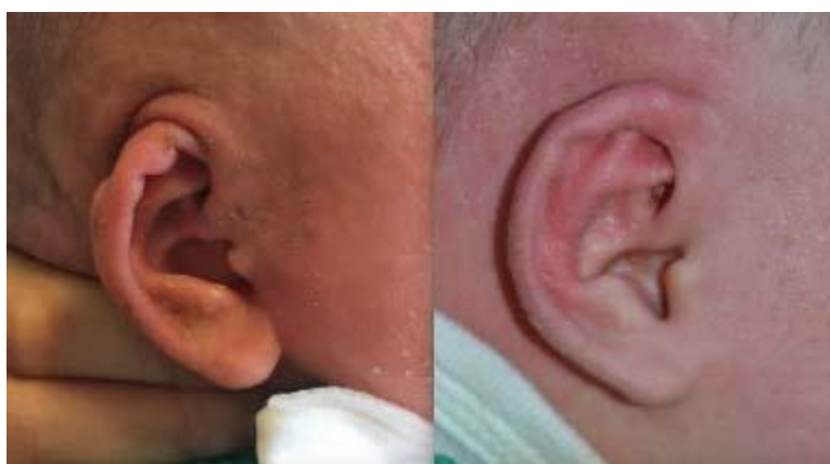
Figure 2. The right-sided cryptotic ear malformation in a newborn is shown on the left. On the right, the patient is shown 2 weeks after therapy.

Cryptotia is a relatively common congenital ear malformation that can be difficult to correct with surgery. The EarWell Infant Ear Correction System provides a nonsurgical, safe, efficacious way to correct this malformation in neonates and should be considered by physicians when treating newborns presenting with ear deformities, including cryptotia. Ideally, the treatment should be started before the first 6 weeks of life.