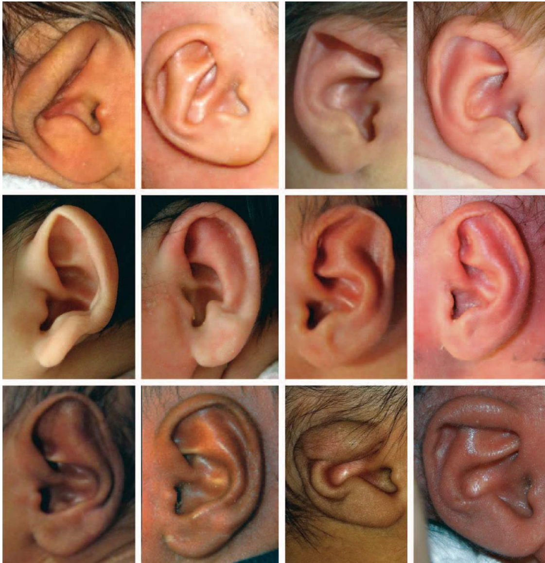
Fig. 3. Ninety-six percent of the parents rated the outcome from molding as excellent or greatly improved. Presented are examples of pretreatment ( left in each pair ) and posttreatment ( right in each pair ) photographs of a child with a constricted ear deformity ( above, left ), a helical deformity ( above, right ), a constricted ear deformity ( center, left ), a Stahl deformity ( center, right ), a Stahl deformity ( below, left ), and a helical rim deformity ( below, right ). Photographs were taken after 2 weeks of treatment. Correction was maintained for 2 years.

off and the ear being held in a stronger, more consistent mold. 3,5-8,10,13,14 Underscored by scientific data, which documented that the ear cartilage is most pliable when circulating estrogens are elevated in the neonatal period, studies have demonstrated ear molding results are best if molding is started before 6 weeks of life. 3,5,8 Fueled by these data, the current study aimed to capture babies at the peak of maternal estrogen levels and use a more rigid molding device to reduce treatment time and obtain a higher level of success than previously reported.