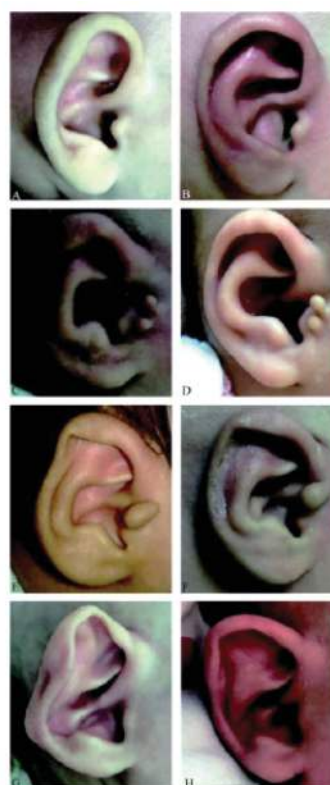
Figure 2 Therapeutic effect of EarWell ear molding.

A: Before treatment: Disappeared antihelix and navicular fossa, skull-auricles angle 60°.